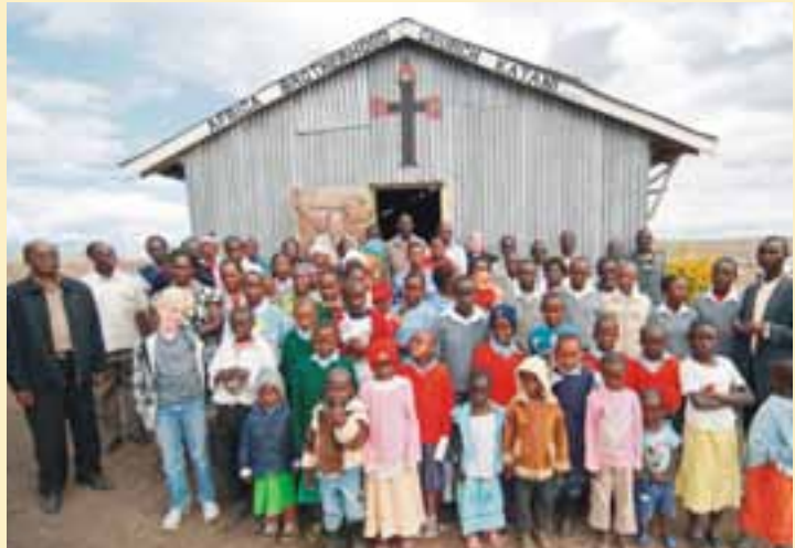
The Katani church is now thriving due to the pastor's training received from Langham that equips him to present God's Word effectively and with relevance.

Through God's grace, we saw much progress in 2012: