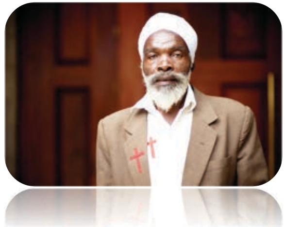
John Stott, July 1996

“Langham has taught me how to hand off God’s truth to the young, how to encourage them in God’s work, how to...call them to remain firm in the faith.”